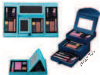
Intriguing cardboard solutions

Toly | Cardboard is environmentally friendly and can be easily branded for a striking look. Toly are presenting several new concepts with sliding drawers, interchangeable inserts and removable compacts.