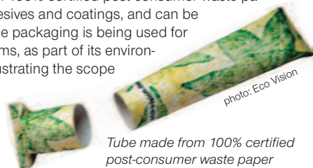
photo: Eco Vision Tube made from 100% certified post-consumer waste paper

Eco Vision | The founders of the sustainable packaging firm Eco Vision have been assigned a US patent for its Eco Tube paper tube packaging with open end and coated cap. The packaging is a solution for lip balms, cosmetics and other products formulated for packaging in a tube. It is made from 100% certified post-consumer waste paper, biodegradable adhesives and coatings, and can be printed with soy inks. The packaging is being used for Organic Essence lip balms, as part of its environmentally friendly line, illustrating the scope for more sustainable packaging in home and personal care lines. The company is also developing the Eco Jar.